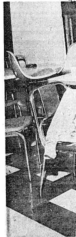
THE SCENE of a double murder at the Heights Motel (above) at 4016 New York Ave. Two women, were sitting at the table when they were shot.